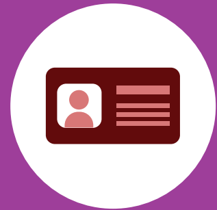
ID Card / Passaport