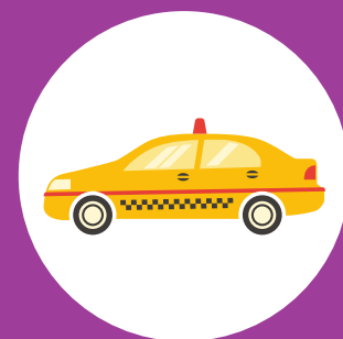
Táxi +351 225 076 400