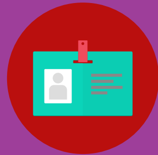
European Health Card