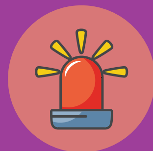
Emergency Number 112