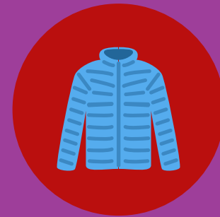
Clothes appropriate for the weather